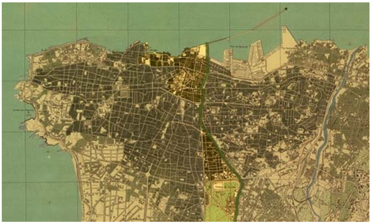
Map of Beirut showing "green line" dividing the city<sup>59</sup>

The tragedy of Lebanon lies in the fact that "the very factors that account for much of the viability, resourcefulness, and integration of the Lebanese are also the factors that are responsible for the erosion of civic ties and national loyalties....In short, the factors that enable at the micro and communal level, disable at the macro and national level. This is, indeed, Lebanon's predicament". So Or, in the words of singer and song-writer Ziad Rahbani, the bard of the Lebanese civil war whose captivating music and ironic lyrics allowed the Lebanese to look at themselves with jaundiced but compassionate eyes: yaa zaman at-ta'ifiyya! ta'ifiyya/ kheli eidek 'alal-howiya; shidd 'alaiha qad ma fiik! ("Oh, these are confessional times, such confessional times!/so best keep your hand on your identity[card]/ and grasp it for all that you are worth!"). The song refers both to the wartime retreat into primary identities, demonstrated by the massive mobilization and ethnic cleansing of neighborhoods, as well as the horrifying political murders perpetrated by militiamen who routinely killed civilians captured at checkpoints along the Green Line on the basis of their religious confession, which at that time was recorded on every Lebanese citizen's identity card. The Green Line bisects the Lebanese capital into Muslim West and Christian East Beirut. (See Map 1, indicating Green Line, below.)