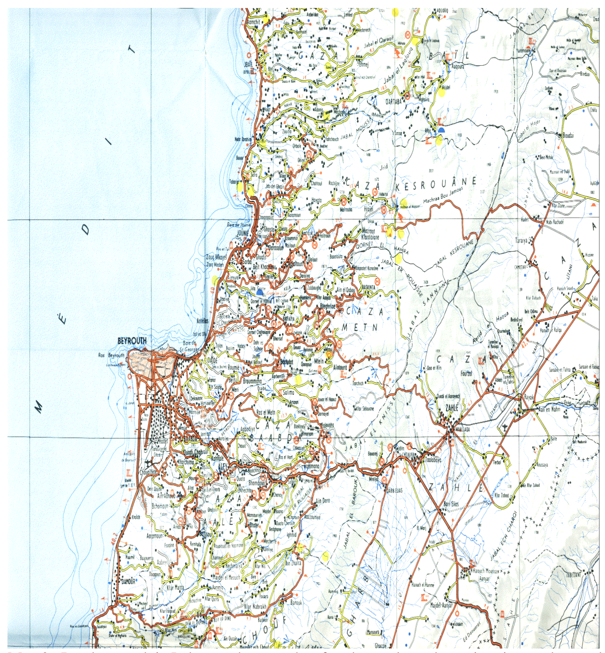
Map 2. Road network in Lebanon shows paths of trade, rural to urban migration, and natural and social borders between different regions surrounding the capital before onset of the civil war.<sup>60</sup>

On the eve of the 1975-1990 war, approximately one third of Lebanon's population of 3.5 million lived in and around Beirut, most in densely clustered multi-storey apartment buildings constructed of concrete, or in squalid shanty-towns built quasi-legally on public or private land at the growing edges of Beirut-proper, particularly in the southern suburbs between downtown and the Airport, where poor Shi'ites from the south intermingled with Palestinian refugees, and in the Bourj Hammoud neigborhood east of predominantly Christian Ashrafiyyeh and south of the port.