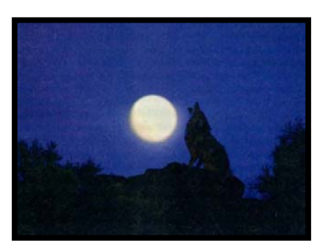
The Wolf - Chechnya's Symbol