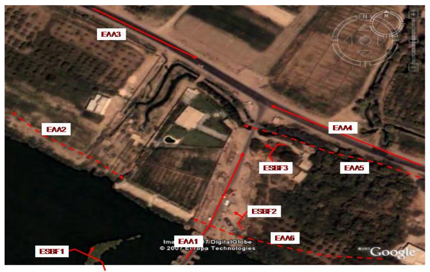
Enemy Situation Template

Armed with my trusty SOP and a HEMTT full of Class IV I left the gate bound for the outpost with the same ample forces as the first dream. When we arrived at the outpost I reached into my bag and pulled out my leader-book and began ticking off the priorities of work. I looked at the terrain and quickly sketched out the likely enemy avenues of approach. I had the obvious roads Route Adams moved from the South-East to the North-West to the North of the outpost and Route Truman crossed the bridge and intersected Route Adams at the corner of the outpost. Additionally, I identified some dismounted approaches using the cover from the dense foliage by the river. I also got on the ground and determined the best way for AIF to attack the outpost was with a dismounted attack along the river or a VBIED strike along the roads. They would need a support by fire to cross the roads or to fix us while they breached the wall; they could even do this from across the river.